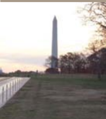
There are 58,256 names on the Wall