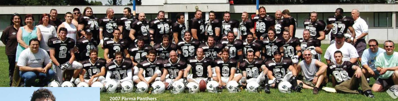
2007 Parma Panthers